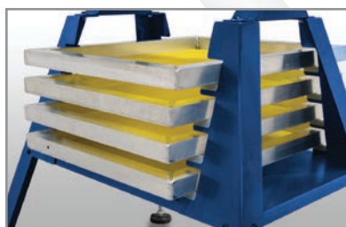
Convenient screen storage in optional floor stand