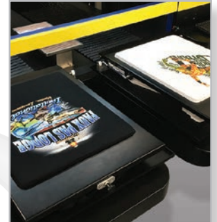
Dual shuttling independent pallets