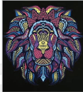
Fast, full-color prints

The Maverick's 12 industrial-grade printheads—six for White ink, plus Cyan, Magenta, Yellow, Black, Red and Green—ensure day-to-day performance and peace of mind, and allow for a greater color gamut. Agitators in the White ink supply tanks and an entire ink re-circulation system ensure consistent results and trouble-free operation.