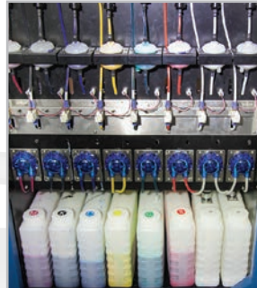
Re-circulating inks provide consistent results